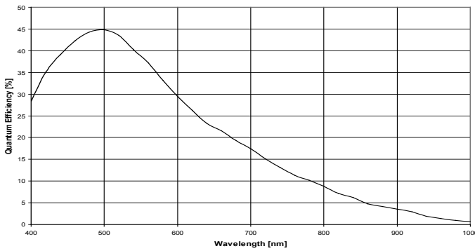
Monochrome Quantum Efficiency